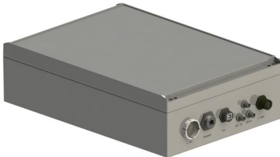
QM1002-0.5-18 in Optional Outdoor Unit Form-Factor