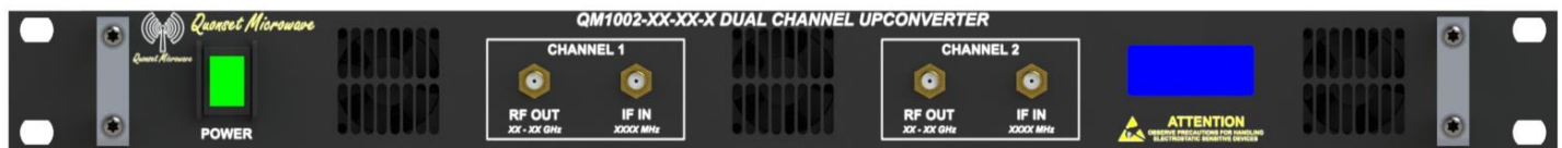
Figure 2. Front panel connections to QM1002-0.5-18.

The necessary front and back panel input/output connections on a QM1002 Series frequency converter are summarized in Table 1. The front-panel connections are shown in Figure 2 while the rear-panel connections are shown in Figure 3. Interface connections for the optional Outdoor Unit are similar.